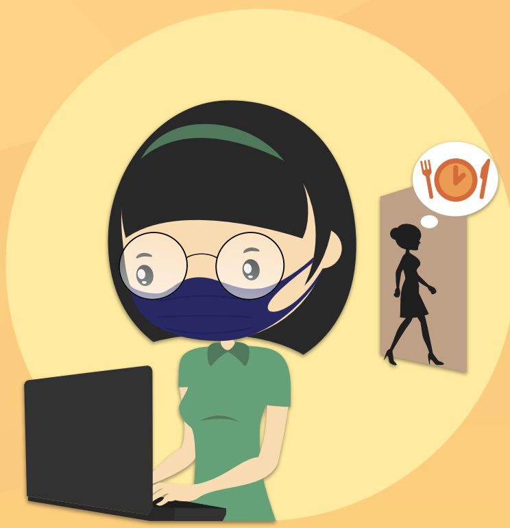
Stagger work and break hours, if unable to work from home