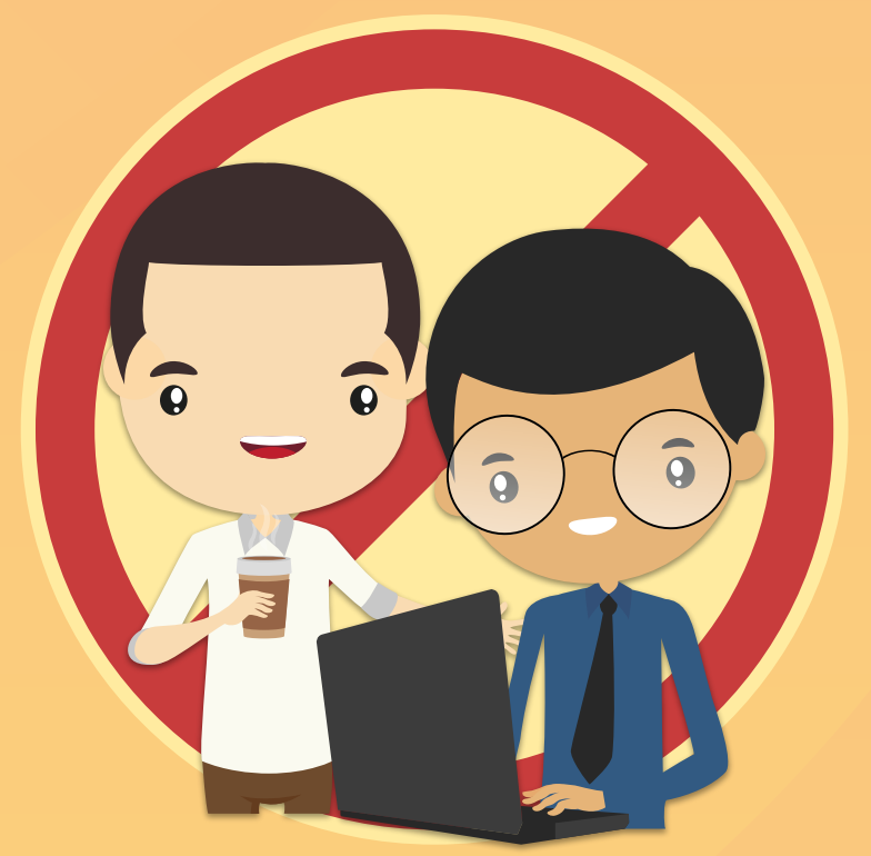
AVOID socialising with colleagues, at or outside workplaces