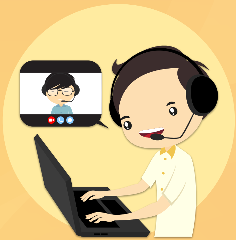
Work from home