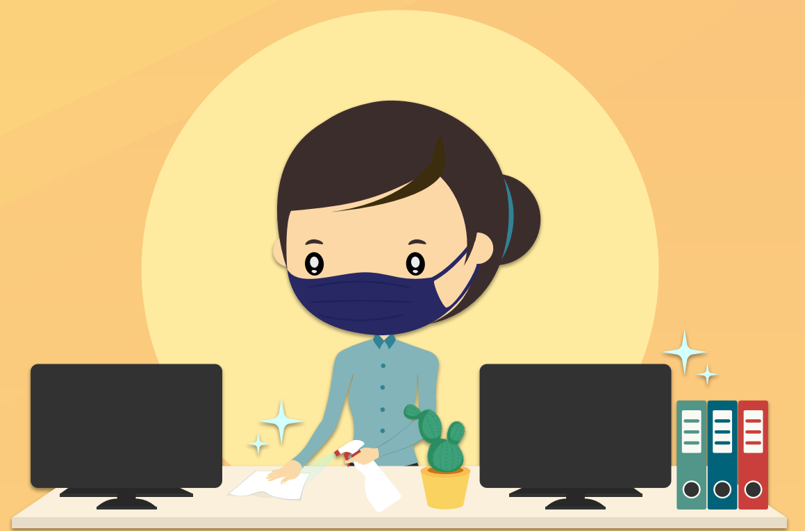
Disinfect shared surfaces before and after use