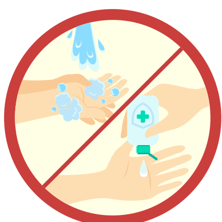
Wash your hands frequently with soap or use hand sanitisers