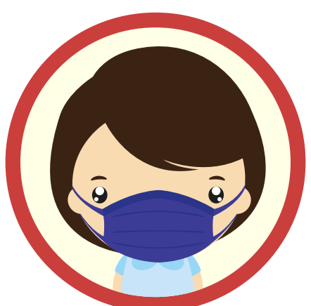
Wear a mask at all times when outside your home

Check in and out with SafeEntry HELP US KEEP YOU SAFE