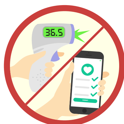
Monitor your temperature twice daily and submit health declarations