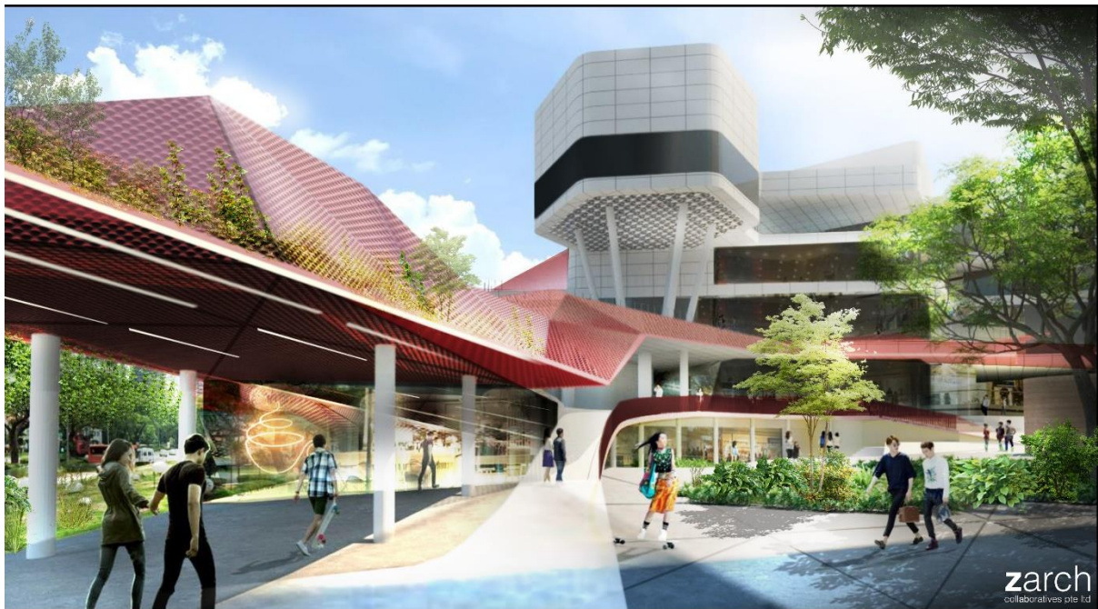
The new *SCAPE to feature a revitalised entranceway

Come early 2024, *SCAPE will reopen its doors with a brand-new sense of approach for a refreshing new look. In addition to delivering an enhanced user experience, this integrated entranceway design seeks to promote cross pollination between the various spaces and encourage deeper collaboration. True to its promise to support youth in their creative pursuits, the new *SCAPE will feature improvements in its building and technology infrastructure to facilitate youth in their exploration and experimentation journeys through various learning pathways in both the physical and digital world.